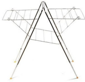
BUTTERFLY SINGLE SS ROUND PIPE