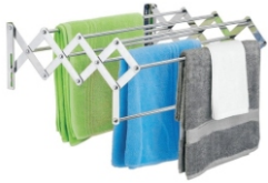
ZIG ZAG CLOTH STAND ( 9 PIPES )