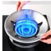
GAS SAVER BURNER STAND