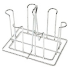
GLASS STAND- RECTANGLE, ROUND, LOTUS