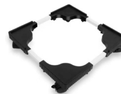
ADJUSTABLE WASHING MACHINE STAND