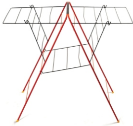
BUTTERFLY SINGLE PC