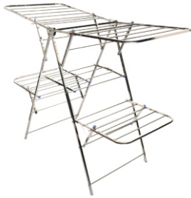
BUTTERFLY DOUBE DECKER