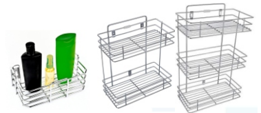
WALL MOUNT SS MULTIPURPOSE STORAGE RACK BOTTLE STAND 1, 2, 3, 4