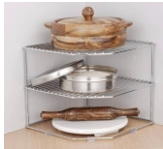
L-CORNER SHELF DIAMOND CORNER