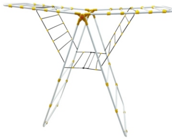
BUTTERFLY PLASTIC BUSH