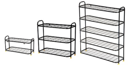
MILD STEEL SHOE RACK 2,3,4,5