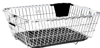
DISH DRAINER WITH BLACK TRAY