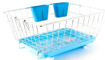
DISH DRAINER WITH BLUE TRAY