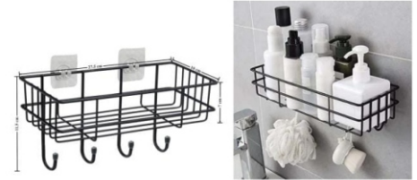
SOAP STAND DOUBLE