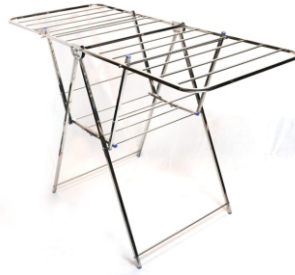
BUTTERFLY SINGLE SS