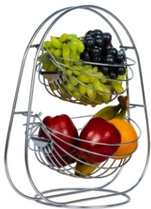
WIRE VEGETABLE TROLLEY ROUND SQUARE HEXAGONE